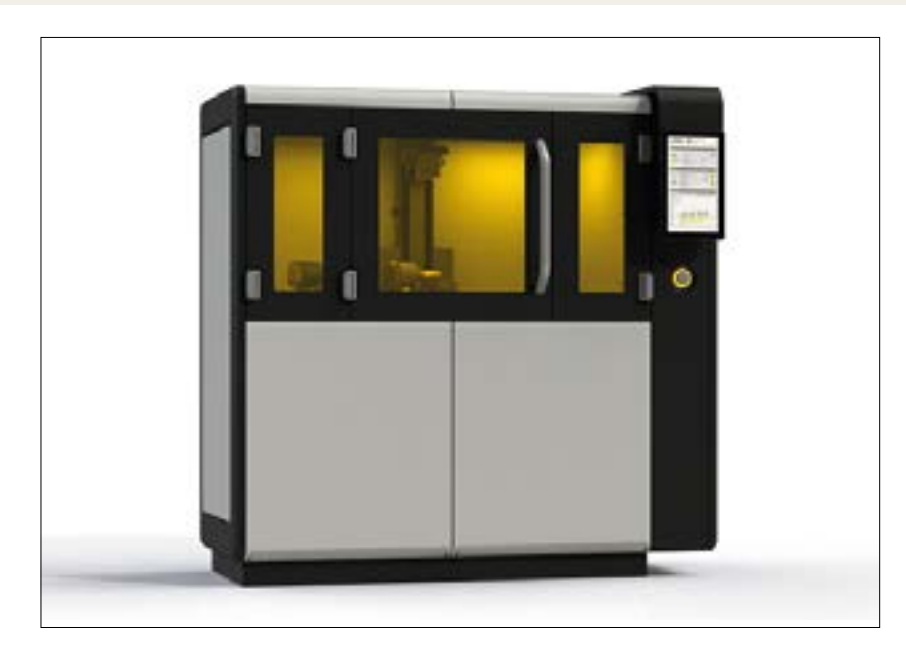
Fig. 1 The CeraFab Multi 2M30: Lithoz's multi-material 3D-printing technology

Fields such as medicine, electronics and aerospace are using 3D-printing to overcome problems that require innovative new technology to make further progress past their already established applications. Multimaterial in 3D-printing is one area that is garnering widespread attention due to the wide range of possibilities that it provides to make parts which are more functional and have improved properties. Lithoz, the global market and technology leader in ceramic additive manufacturing, has been developing ground-breaking multi-material 3D-printing technology and will review its work on this fascinating topic in this article.