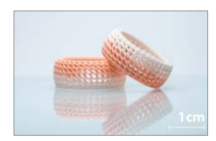
Fig. 6 Dual-coloured alumina ring (as fired) 3D-printed on the CeraFab Multi 2M30