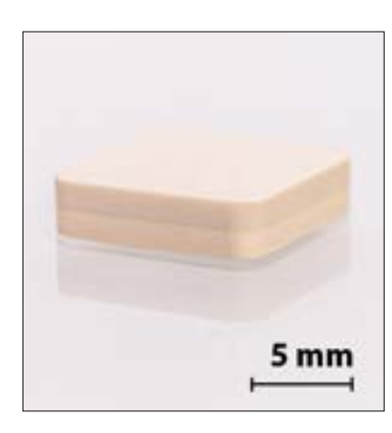
Fig. 4 ZTA-Al<sub>2</sub>O<sub>3</sub> composites green part manufactured on the CeraFab Multi 2M30

colored alumina for luxury applications. The sintered ring, consisting of a voronoi structure, is shown in Fig. 6.