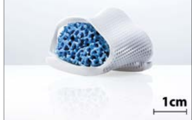
Fig. 7 Mandibular cage made of zirconia with a three-dimensional interconnected pore network made of HA/TCP; material combination in one printing process is under development

Temperature Co-Fired Ceramics (LTCC and HTCC). These are routinely made by stacking green dielectric layers upon which printed circuitry has been inscribed, followed by co-firing to make a dense 3D-circuit. A significant advantage of applying multi-material 3D-printing here is that it uses conventional ceramic powders and reduces the steps involved in the manufacturing process, minimizing fabrication costs [3]. More complex structures can be realized which have great potential from prototypes to serial production.